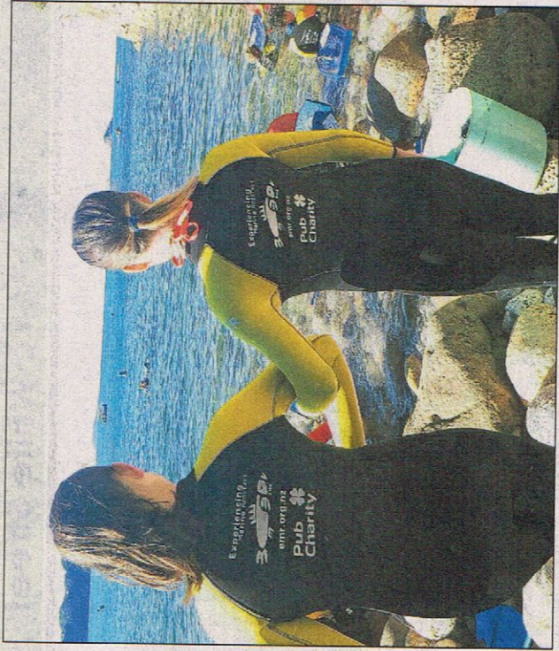
Pub Charity funded this year 50 new wetsuits for use in the Experiencing Marine Reserves programme.

The Friends of Te-Whanganui-A-Hei Marine