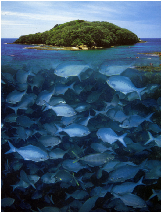
Fig. 3. An underwater and overwater view of the first Marine Reserve in New Zealand, at Goat Island, Leigh.

sea and hence allow the free development of natural biodiversity at all levels. At first sight these rules seem extreme and initially many people thought they were unnecessarily so. However, when ‘weaker’ versions were tried, it became clear the firm versions were essential for both scientific and practical reasons (Willis et al., 2003; Denny and Babcock, 2004).