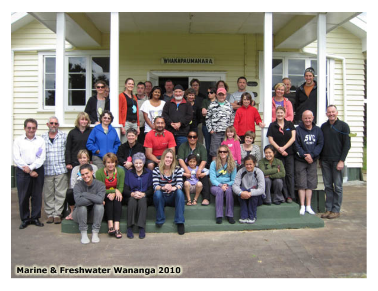
National Marine & Freshwater Education Wananga/Conference 2010