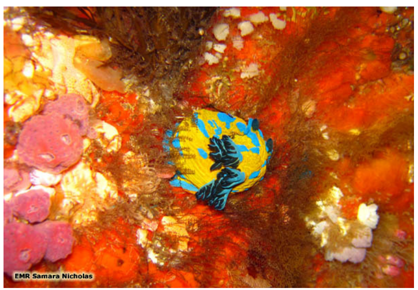
Baxter found two different types of nudibranch - this one is Tambja verconis